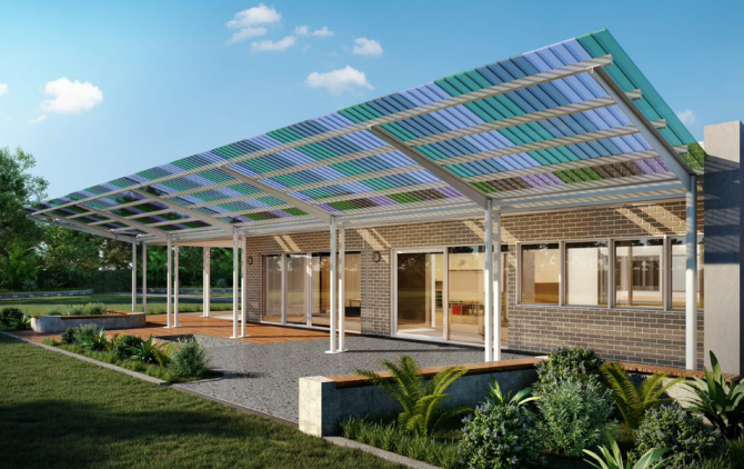
Artist impressions of our new Foundation indoor/outdoor spaces - we can't wait for it to be finished!