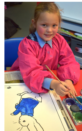
The Peter Rabbit art continues in Foundation Hassold.