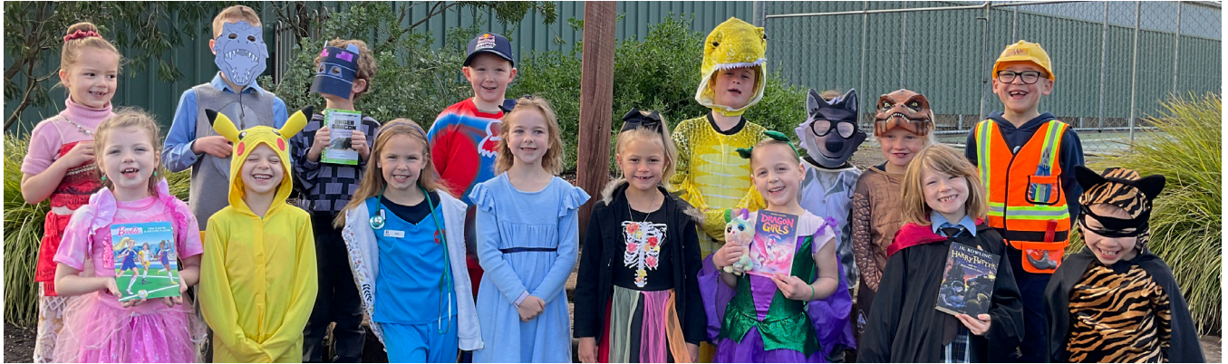
Class 1K looking ready to READ , GROW and INSPIRE for Book Week.