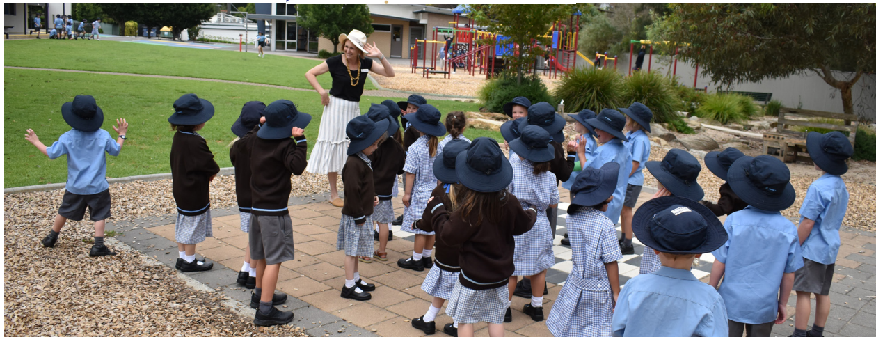
Foundation Hassold playing 'French Beans'.