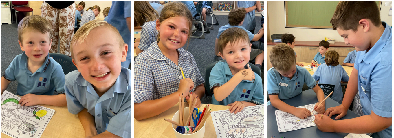
Year 1 students meet their Year 5 Buddies!