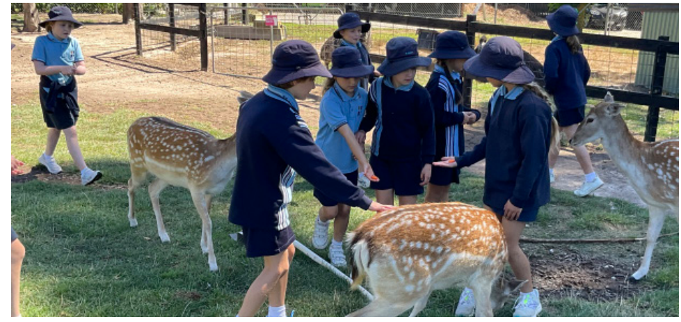
Year 3s - Farm Barn Visit