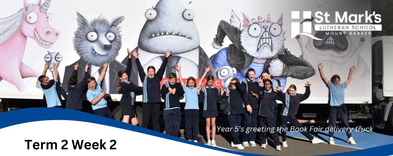
Year 5's greeting the Book Fair delivery truck