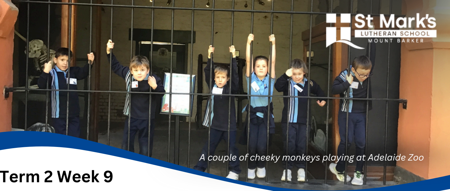
A couple of cheeky monkeys playing at Adelaide Zoo