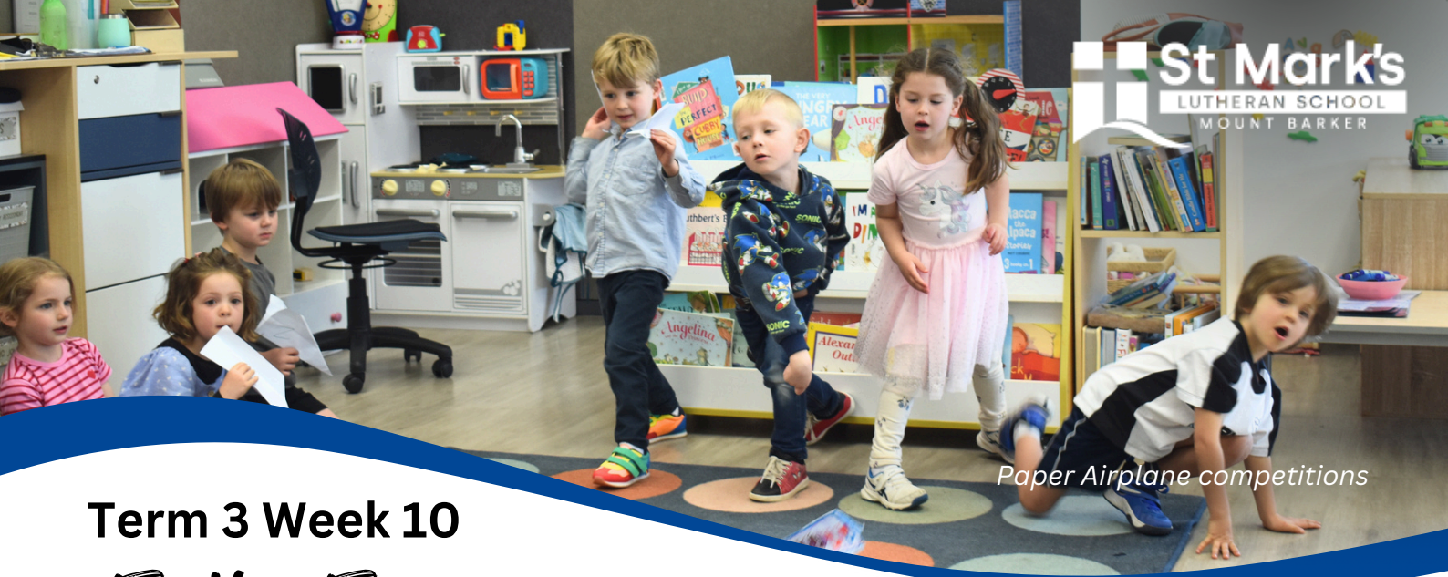
Paper Airplane competitions