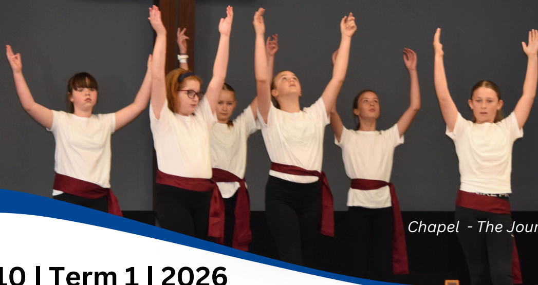
Chapel - The Journey to Easter